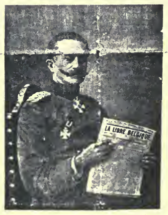
NOTHER OTHER OUR NERVER & FORCER PAR LA LEFTER THE RENOVALY HER OF RALES OF REAL REAL OF R DANNER OF COMER RELEASER

SON EXCELLENCE LE GOUVERAEUR B* VON BISSING ET SON AMIE INTIME